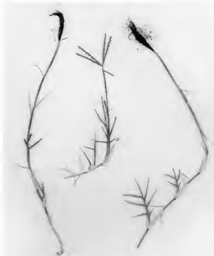
Ustilago cynodontis on Bermuda grass ( Cynodon dactylon )